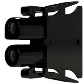
4.0 mm connector