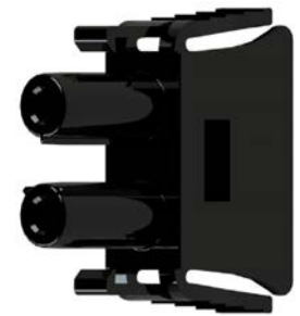
2.4 mm connector