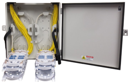
Fiber Splice Box - "D" Size Tray ASBFSB1023785-0002