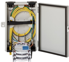
Fiber Splice Box - "A" Size Tray ASBFSB1023784-0004