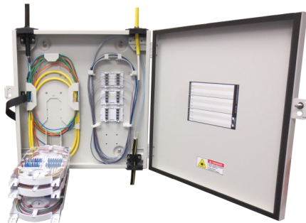
Fiber Splice Box - "D" Size Ribbon + Tray ASBFSB1025487