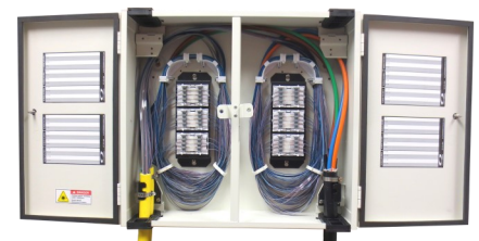
Fiber Splice Box - FD3 Ribbon