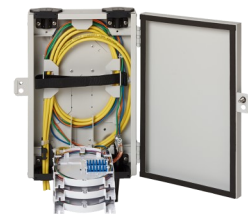
Fiber Splice Box - "A" Size Tray

This family of enclosures provides improved splice management and access, a variety of modular cable port accessories and increased splice storage density in several housing sizes and capacities.