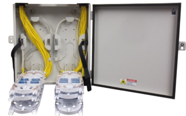
Fiber Splice Box - "D" Size Tray