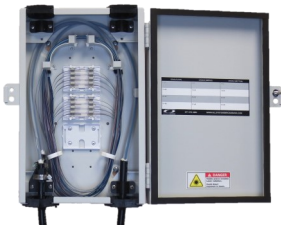
Fiber Splice Box - "A" Size Ribbon ASBFSB1023784-0003