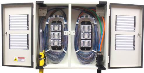
Fiber Splice Box - FD3 Ribbon ASBFD31025483