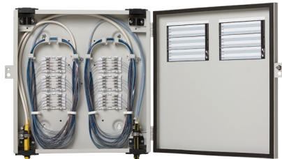
Fiber Splice Box - "D" Size Ribbon ASBFSB1023785-0001